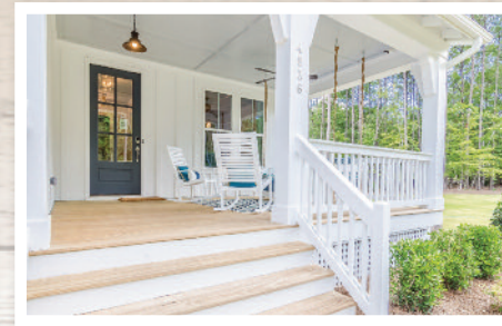
DECORATED MODEL HOME OPEN DAILY

Located right across the street from Glen Creek, SOUTH GARNER HIGH SCHOOL . Please confirm schools with the Wake County Public School System http://www.wcpss.net