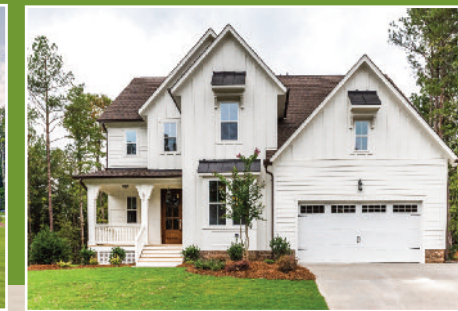
1st Floor Masters