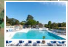
BRICK LANDING POOL