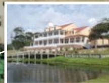
THE LINKS AT BRICK LANDING