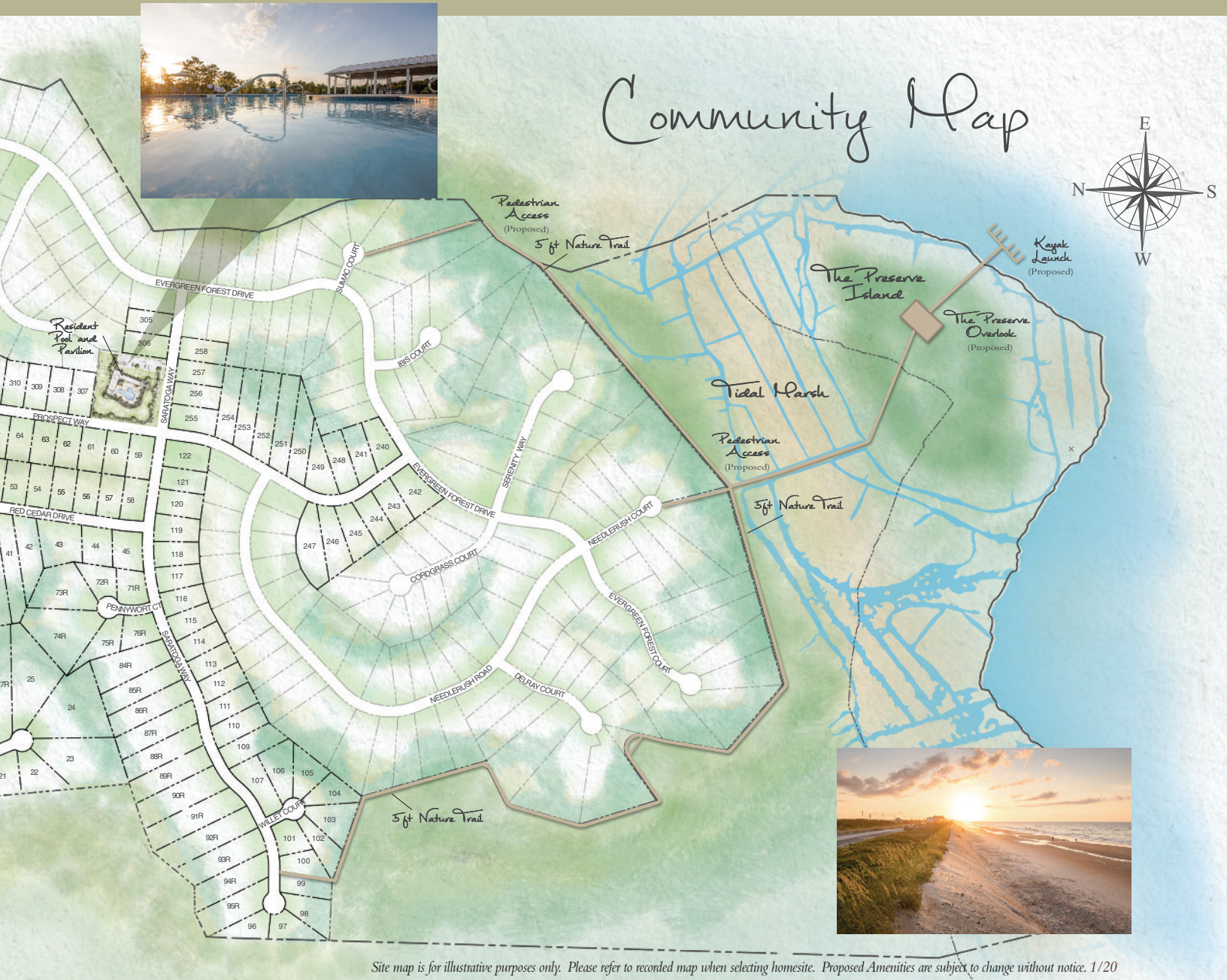
Site map is for illustrative purposes only. Please refer to recorded map when selecting homesite. Proposed Amenities are subject to change without notice. 1/20

ThePreserveAtTidewater.com 910-899-5145 | ThePreserve@FMBnewhomes.com 105 Wax Myrtle Way, Sneads Ferry, NC 28460