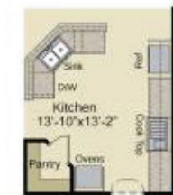
Optional Gourmet Kitchen