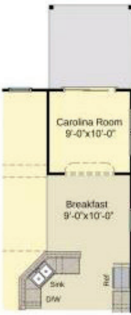
Optional Carolina Room