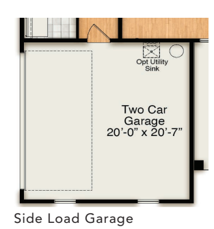
Opt Third Car Garage 11'-6" x 22'-2" Opt Toy Opt Toy Two Car Garage 20'-0" x 20'-7"